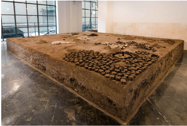
Figure 6. Dineo Seshee Bopape, sa ____ ke lerole, (sa lerole ke ____) (2016).