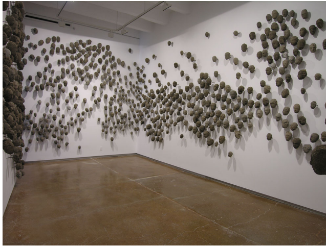
Figure 4. Ledelle Moe, Congregation (2005–19).