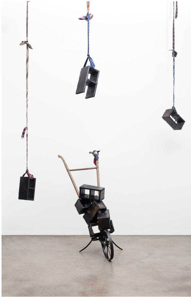
Figure 13. Simphiwe Ndzube, To Dream Without Land to Plough (2016).

its origin), is an already densely populated settlement comprising more than 800 tin shacks and 3,000-plus residents and, in a grim example of sardonic South African humour, next to this settlement is another called ‘Sanitizer’, and nearby another called ‘19’ (as in Covid-19). 109 Informal settlements like these face intense risks associated with climate change. 110 Many are ill-prepared for the floods and landslides resulting from poor-quality buildings and a lack of infrastructure to prevent flooding, withstand heavy storms and cope with heat waves.