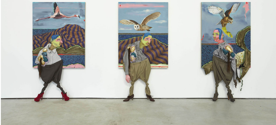
Figure 9. Simphiwe Ndzube, Demigod with Totem, #3 #2 #1 (2019).

an ethereal entity, as a mere concept', instead grasping with both hands the humus, the soil, the shady creatures from the underground. 90 In both formulations, 'fabulation is an addition to the reality it deals with'. 91 The two interpretations allow for analysis of 'arts practice and cultural research through "material-semiotic entanglements" of the factual, the fictional, and the fabulated'. 92 Much like Deleuze politically weaving together peoples, earth and territory and Haraway speculating about the invention of new worlds in their storytelling, Ndzube's 'makes potentialities appear and gives strength to the potentialities it develops'. 93