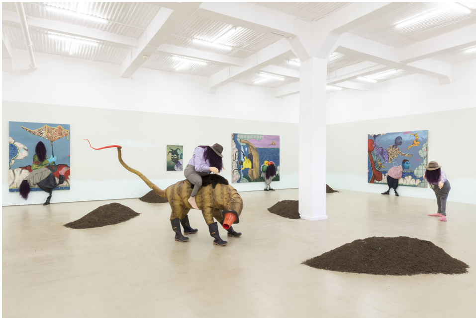
Figure 10. Simphiwe Ndzube, Uncharted Lands and Trackless Seas (2018).

ingesting or being digested, collapsing the boundaries of the organic and synthetic, the strange rubber sack a cultural goody bag, 97 Ndzube's characters also offer a wealth of insight into the processes of fabulation behind his works. M. Neelika Jayawardane discusses the bricolage involved in the construction of Ndzube's characters, describing them as 'learning how to be subjects of their own making', assembled out of roadside construction site material and cast-off clothing and reflecting the ways in which South Africans struggle to face the impact of colonial and apartheid history on their fragmented families, communities and environments. 98 Interpretation of Ndzube's Mine Moon milieu has centred around the reservoir of magical realist metaphors evident in his carnivalesque portraits and humanoid figures; less attention has been paid to the environments in which they exist: the integration of nature, landscape and dwellings in his installations, evidenced by the constancy of representations of land in his installations, either heaps of soil or vast tracts of beach sand.