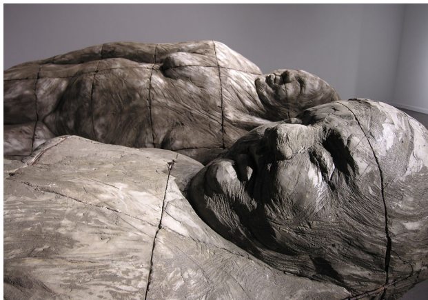
Figure 3. Ledelle Moe, Displacements (2011–12).

act in which she acknowledges the land while also removing a small part of it and displacing it. Moe explains: ‘in doing this, I felt it was a small gesture of “land claim” of taking what is not mine and acknowledging that act’. 34