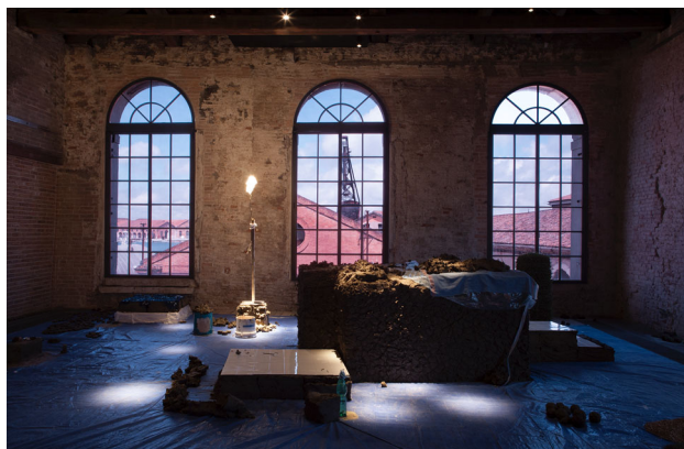
Figure 8. Dineo Seshee Bopape, Marapo a yona Dinaledi (Its Bones the Stars) (2019).

‘[t]he issue might best be understood as a problem of medium, not unlike the reductive enterprise of mapping: flattening curves and concealing distortions in an attempt to impose scholarly narrative on a painting, sculpture, or piece of music that actively defies narrative conventions’. 66