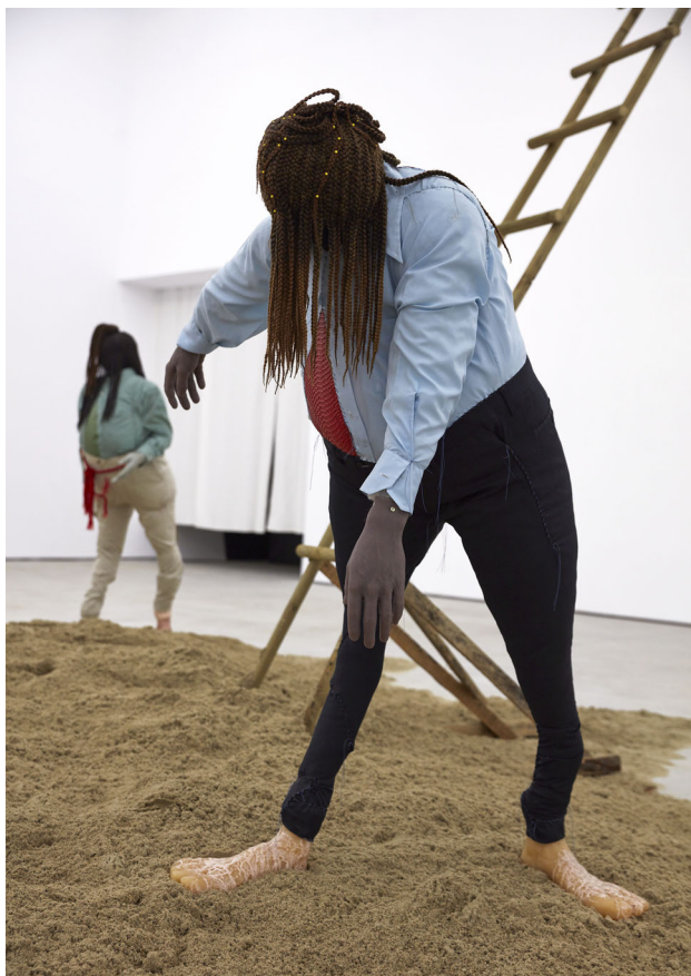
Figure 11. Simphiwe Ndzube, In the Order of Elephants After the Rain (2019).

lucky enough to find employment as a cleaner – was to be in the service of maintaining the ‘prettiness’ of the surfing villages. But Masiphumelele’s residents did not remain still; it has been the site of numerous protests against existing conditions – lack of access to basic sanitation and healthcare, and failures by the present government to deliver housing projects as promised. 99