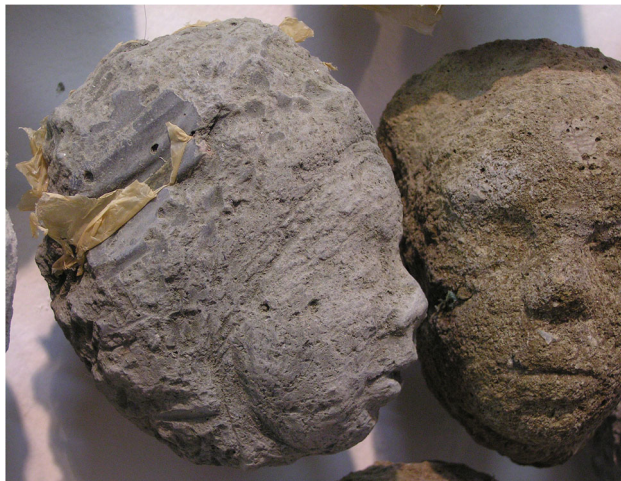
Figure 5. Ledelle Moe, Detail from Congregation (2005–19).

comparisons with those of Villa, Hlungwani and other prominent sculptors, but Villa worked primarily in steel and bronze and Hlungwani in wood; it is Moe's choice of material that is the real calling card in her works. Concrete both reveals and obscures some of the mystery of her metaphors.