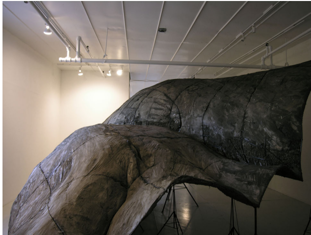
Figure 2. Ledelle Moe, Land (2006).